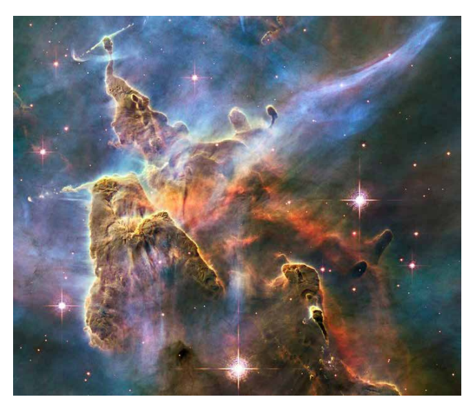
A 3 light-year tall pillar, where new stars are forming.

7. Find these objects and answer the questions: